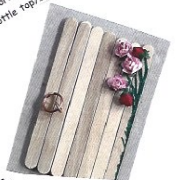
Lolly stick "fairy doors" for us to use Saturday