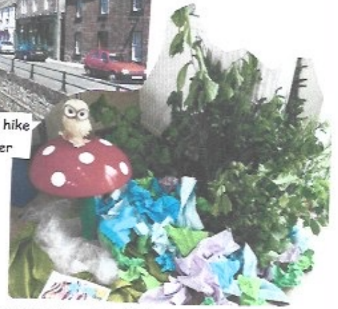
Created our own indoor bluebell woods Alyth Guide Hall