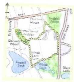
Bluebell Wood Enjoy a walk through a spectacular Bluebell Wood and visit the scenic White Lock