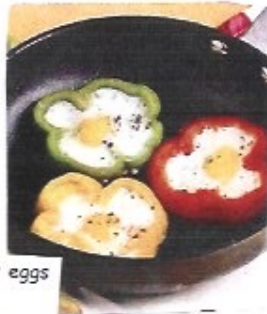
Our special Sunny eggs for breakfast Slice of pepper + egg Fry gently in tsp oil

After lunch took No 57 bus to Blairgowrie Dismounted at Piggy Lane, Woodlands and country walked thru Bluebell Woods