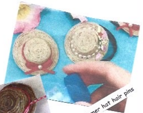
Before bedtime crafted summer hat hair pins Bottle top/string/card