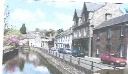
Went on a "wool" treasure hike thru old Alyth before supper