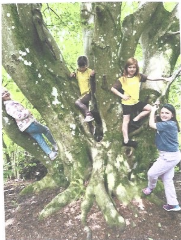
Fun in the Woods

Stopped to make fairy houses and used our doorways made on Friday evening